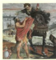
St. Martin Bishop of Tours 316 - 397 Memorial - 11 November + St. Martin, pray for us!

The Birthday treat request form has been updated. Please complete and return