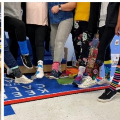
Twin Rivers Head Start celebrated Dr. Seuss' birthday by participating in fun activities for Seuss Week inspired by The Cat in the Hat , Fox in Socks , Green Eggs and Ham , and The Lorax .