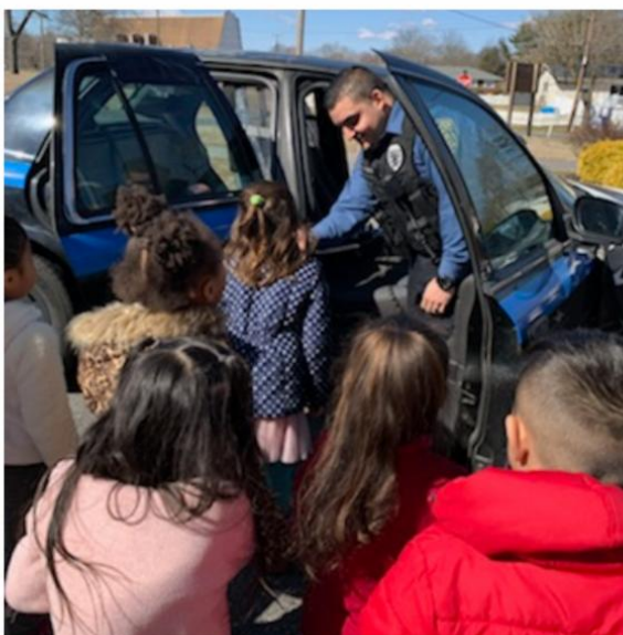
Children at Hammonton Head Start learned about the importance of safety during a visit from a local law enforcement officer.