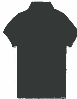
Hunter Green (8 th Grade)