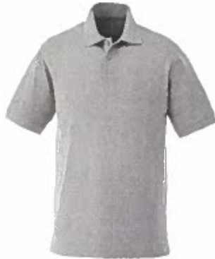
Gray (6 th Grade)