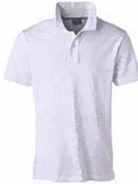
White (7 th Grade)