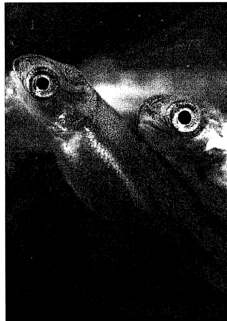
As they get older, the sacs shrink, and the babies look more like fish.