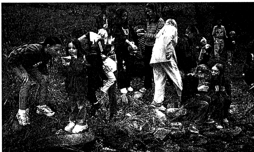
See my students? They're helping an endangered species!