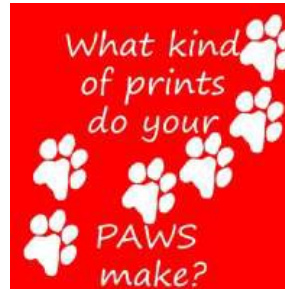
Imprint Color: White