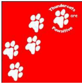
T-shirt color: RED OR BLACK