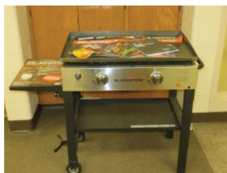
Griddle Cooking Station