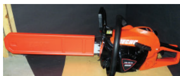
Echo Chain Saw