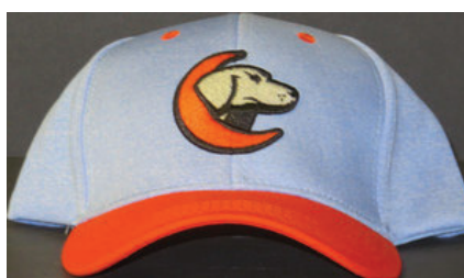
Mankato Moon Dogs Outing