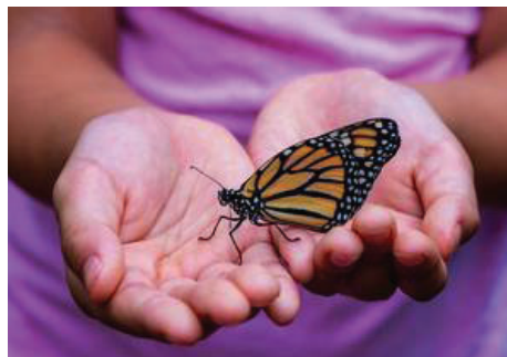
Butterfly House & Aquarium, Sioux Falls