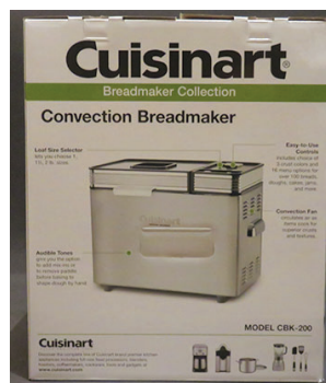
Convection Bread Machine