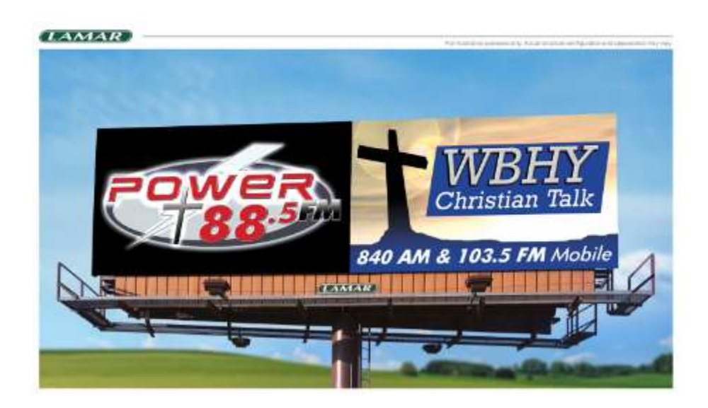
I<u>t is easy to</u> "Give where you get your blessings!"

To Add an Email address to receive this weekly Power 88 notes, click HERE: