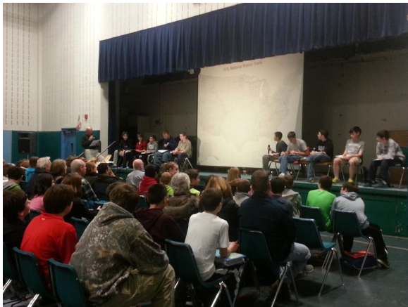
The Geography Bee underway.