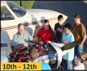
10th - 12th

Aircraft Structural prepares students for careers in aircraft structure, manufacturing, and repair. The program emphasizes a combination of aircraft structural theory and practical application necessary for successful employment. Program graduates are eligible to become aircraft structural specialists.