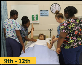
9th - 12th

Healthcare Science prepares students for a smooth transition into post-secondary education or entry-level positions in the civilian or military healthcare workforce. Healthcare science provides challenging academic courses, relevant on-the-job experience, and specialized technical skills to prepare students.