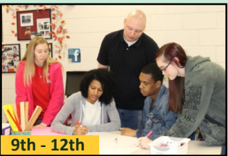
9th - 12th

Teaching as a Profession is designed for a career in the field of education. The practicum offers students an actual classroom experience. Articulated college credit is offered for those who complete this pathway & advancement.