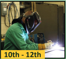
10th - 12th

In the Welding dual-enrollment program, students earn both high school and college credit. Program learning opportunities develop academic, technical, professional knowledge and skills required for job acquisition, retention and advancement. Program completers earn Technical Certificates and have the qualifications of a welding and joining technician, and are prepared to take welding qualification tests for employment.