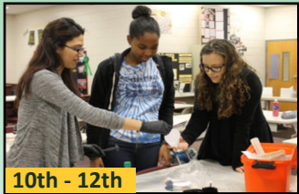
10th - 12th

Law Enforcement Services emphasizes the role of the police, judicial and correctional systems. Students interested in public safety careers will participate in crime scene investigations, mock trials and criminal