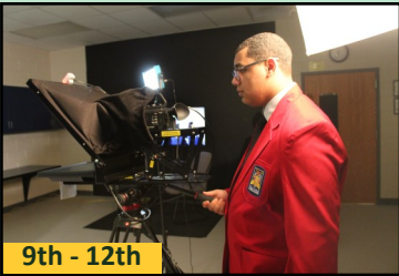
9th - 12th

The AVF pathway prepares students for employment or entry into a post-secondary education program in the audio and video technology career field. Students will learn topics such as: terminology, safety, basic equipment, script writing, production teams, production and programming, lighting, recording and editing, studio production, and professional ethics.