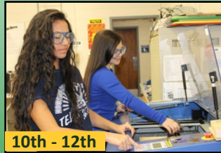
10th - 12th

Engineering & Technology combine hands-on application and problem solving projects using the latest interactive educational tools. Students learn about technological systems and their impact on society; they also gain valuable teamwork skills.