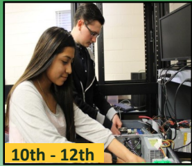
10th - 12th

Information Technology graduates are prepared for a variety of careers to include network administrator, computer programmer, Office specialist, PC repair technician, network installation, and computer help desk assistant.