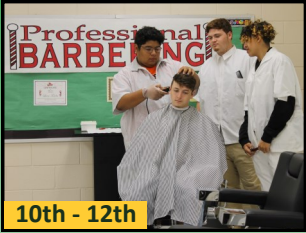
10th - 12th

The Barbering program emphasizes specialized training in safety, sanitation, hair treatments and manipulations, haircutting techniques, shaving, skin care, reception, sales, and management. Students are eligible for the barbering technical certificate of credit and may continue course work after high school graduation to complete the barbering diploma at CGTC.