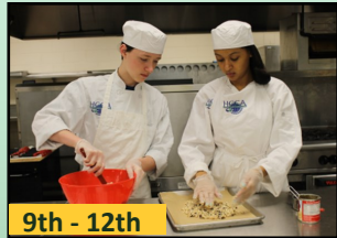
9th - 12th

Culinary Arts teaches students the "art" of cooking and is for those who plan to work in the culinary field. Students gain knowledge in safety and sanitation, food preparation, cost control, banquet and catering.