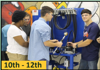
10th - 12th

Industrial Maintenance students gain hands-on, practical experience in welding, hydraulics, electrical, mechanical fundamentals and machine alignment. Students build skills in electronics, computerized equipment maintenance and preventative/predictive maintenance. The Introduction to Motor Controls technical certificate provides hands-on experience for students. This embedded certificate allows for a seamless pathway for students interested in the Industrial Systems Technology profession.