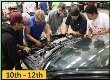
10th - 12th

This program allows students to be eligible to receive the Automotive Service Excellence G1 Certification. Graduates are prepared for employment in automotive dealerships, repair facilities, lube shops, undercar specialty shops and self employment.