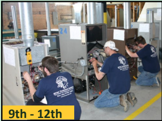
9th - 12th

The Air Conditioning Technology programs prepare students for careers in the air condition industry. Students develop academic, occupational and professional knowledge and skills required for job acquisition, retention and advancement.