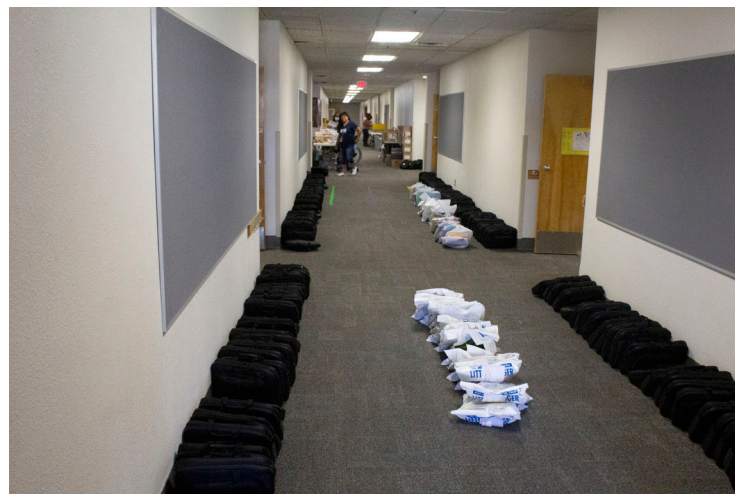
At Lake View Elementary rows of iPads in cases extend down many hallways.