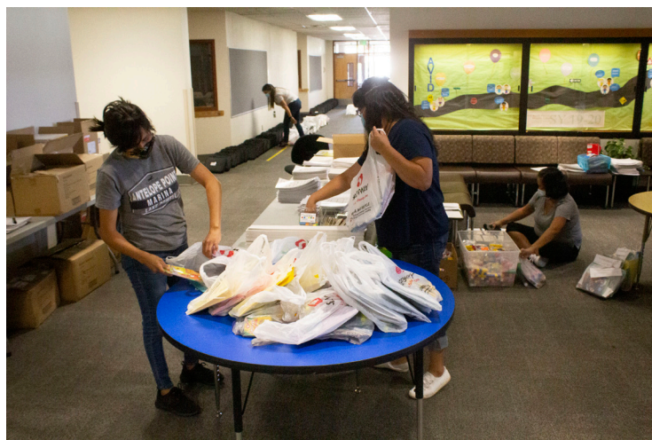
Lake View staff prepare art, math and science supplies included with each student's iPad.