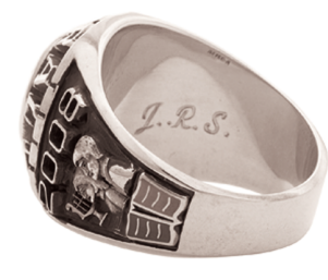
ENGRAVE UP TO FOUR (4) LETTERS