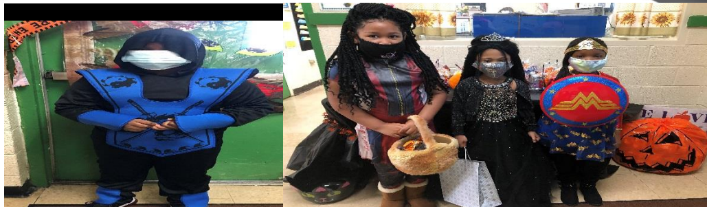
First graders "Scare Away Drugs"