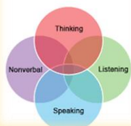
The Four Communication Skills