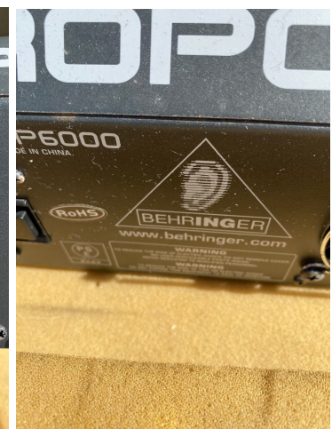
Item F-Europower pmp 6000 Mixer Board-case included