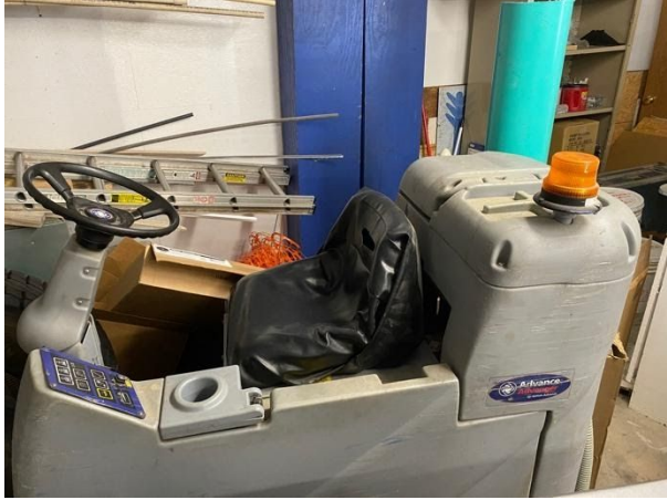
Item G-Floor Scrubbing Machine-Serial #: 1681027