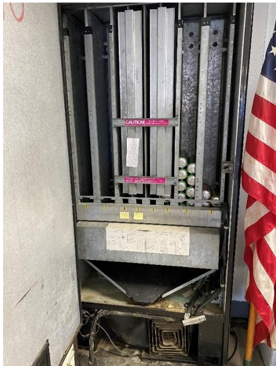
Item B-Pop Vending Machine with key