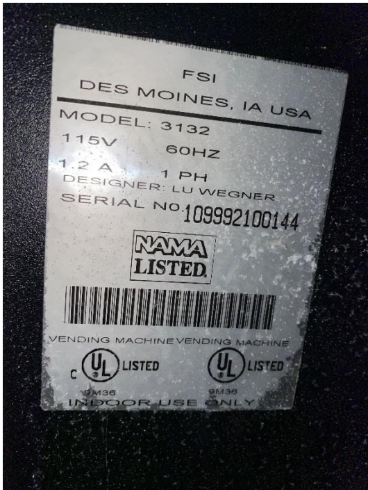
Item A-Candy Vending Machine with key