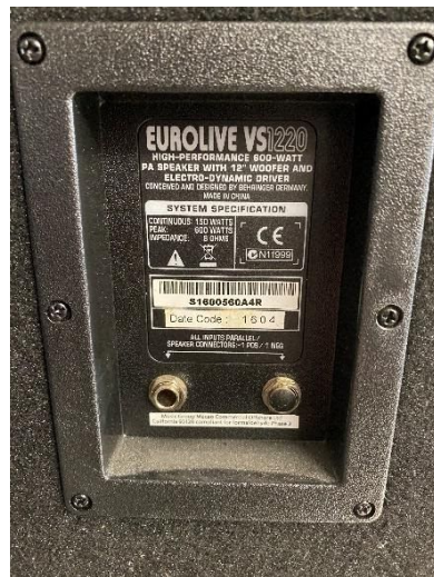
Item E-Behringer Speakers