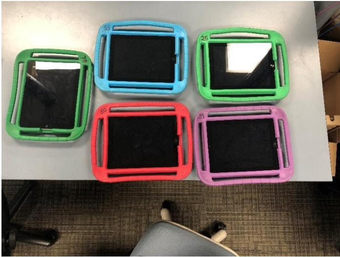
Item H-Generation 2 iPads-70 iPads with 16 GB, 2 iPads with 32 GB