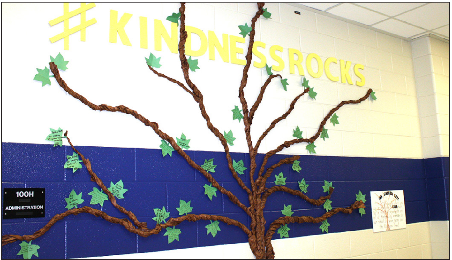
This year's theme is #kindness rocks. As you can see, the RCES students are already rocking it! This "Kindness Tree" on the Blue Hall already displays only the many acts of kindness that have been written on leaves. At this rate, it will not be long before the tree is in full bloom with leaves overlapping. The challenge is on for all of the RCES staff and students.