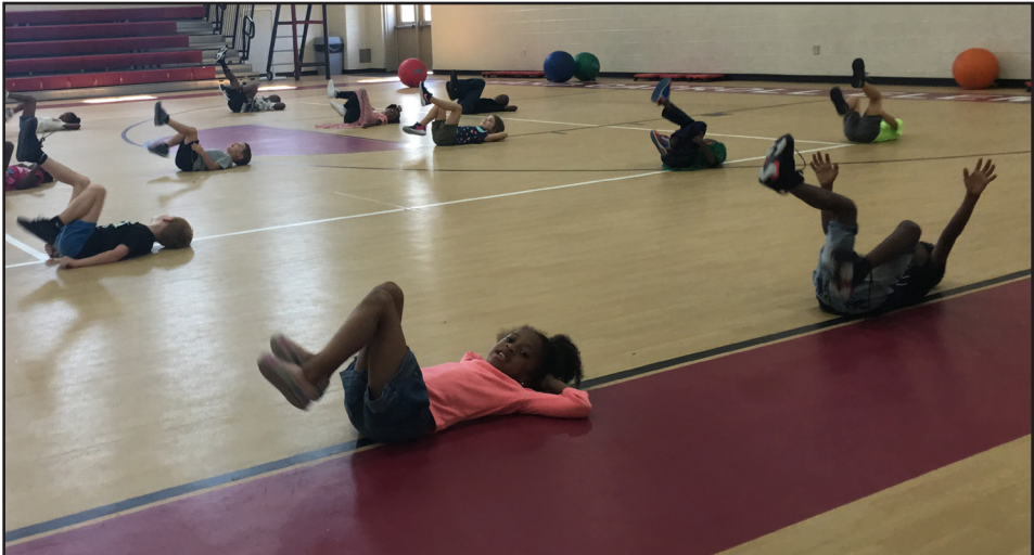
PE is good for the body, mind, and soul. These students are working hard.