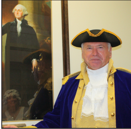
George Washington admires a portrait of himself.