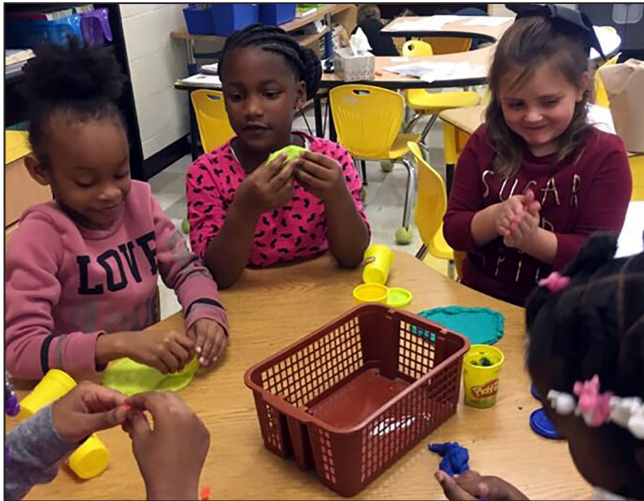
Mrs. Murdaugh's first grade students enjoy creating things with Play-Doh during one of the recent rainy days. Looking at their faces, it seems they enjoyed being creative on what many thought was a dreary day.