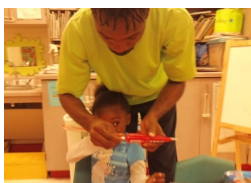
Dad helping child at school