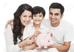
Family with Piggy Bank

"He is a good father, and a good husband... He is my talented, resourceful, caring, amazing dad."