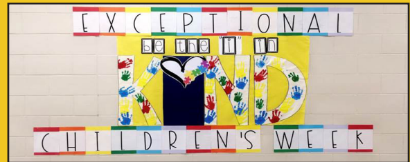
Langston Road Elementary