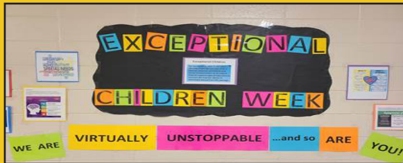
Feagin Mill Middle School