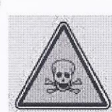
Toxic Materials Sign