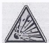
Explosive Materials Sign