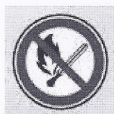
No Open Flames