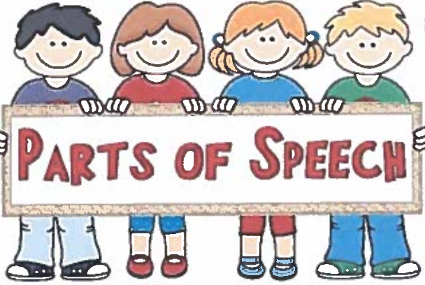
Put the words in the correct column.