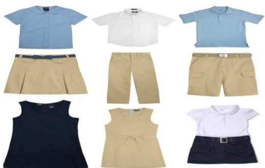
Cute School Uniforms