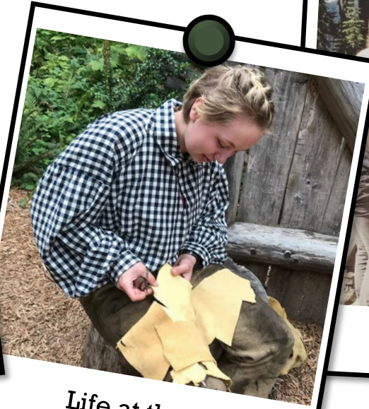
Life at the Fort