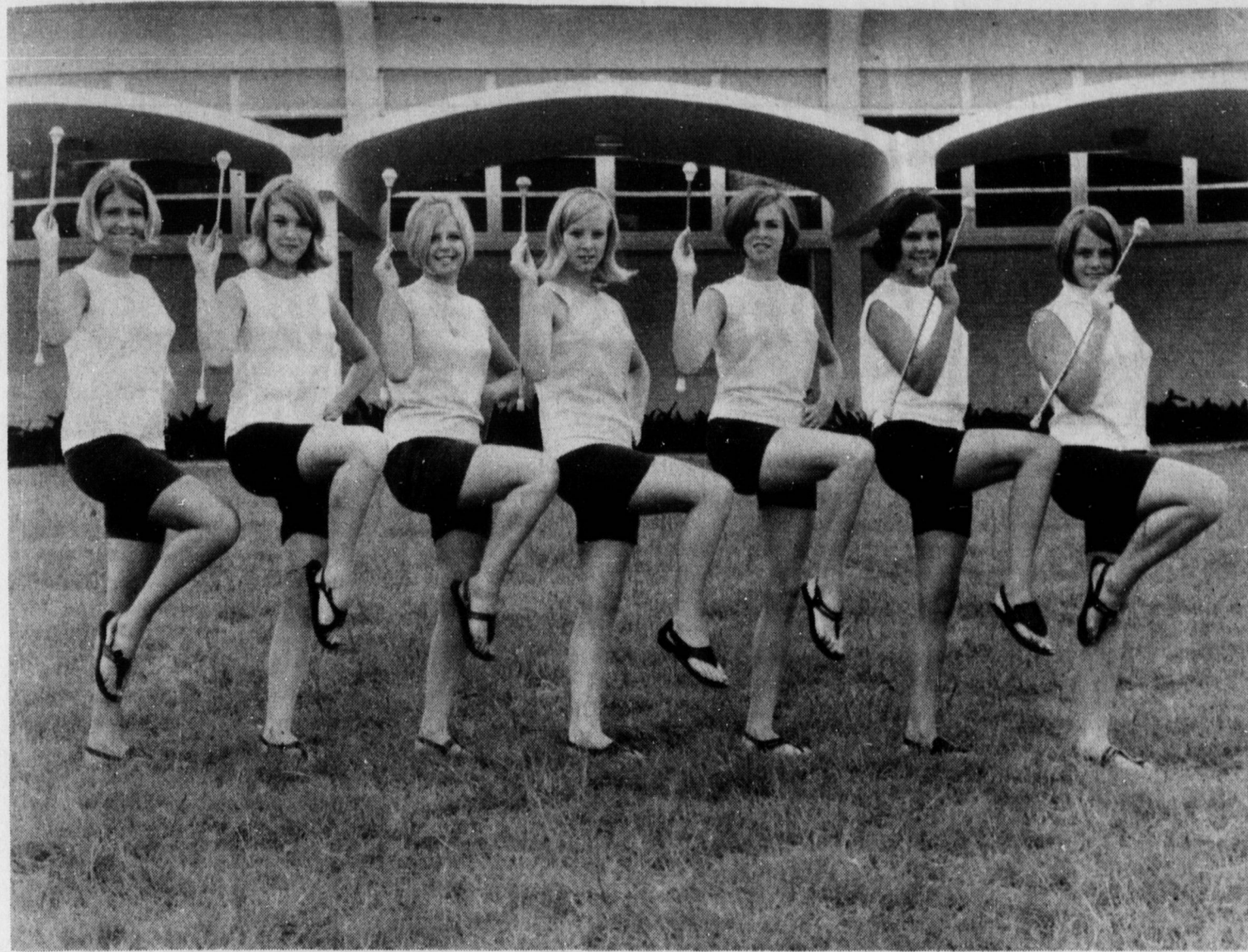
Perry High School Majorettes Back from Florida Camp