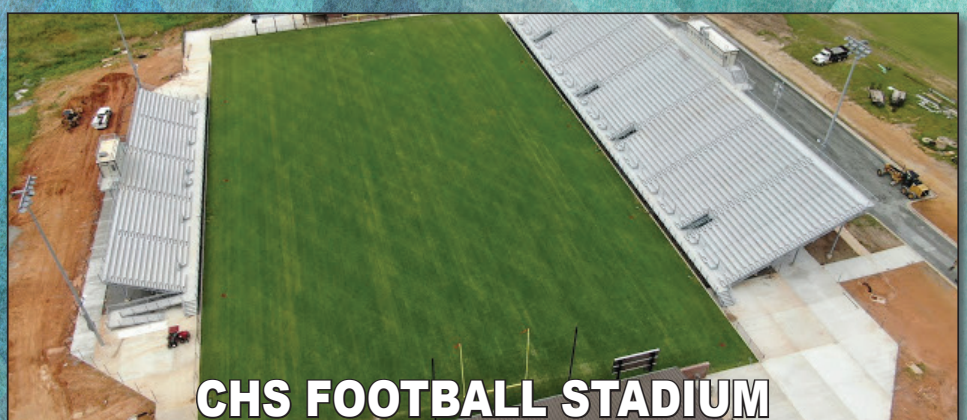
CHS FOOTBALL STADIUM