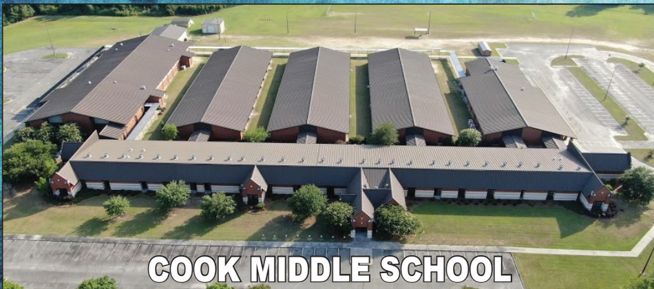
COOK MIDDLE SCHOOL