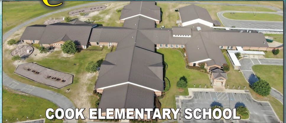
COOK ELEMENTARY SCHOOL