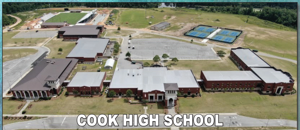
COOK HIGH SCHOOL