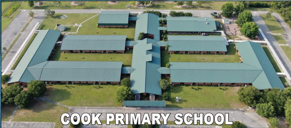
COOK PRIMARY SCHOOL