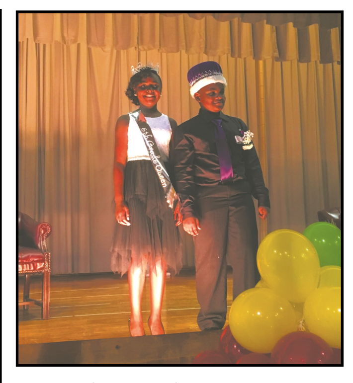
Congratulations to the Homecoming King and Queen

2015-2016 Yearbook on Sale for $20 Paw Print Magnets for $5