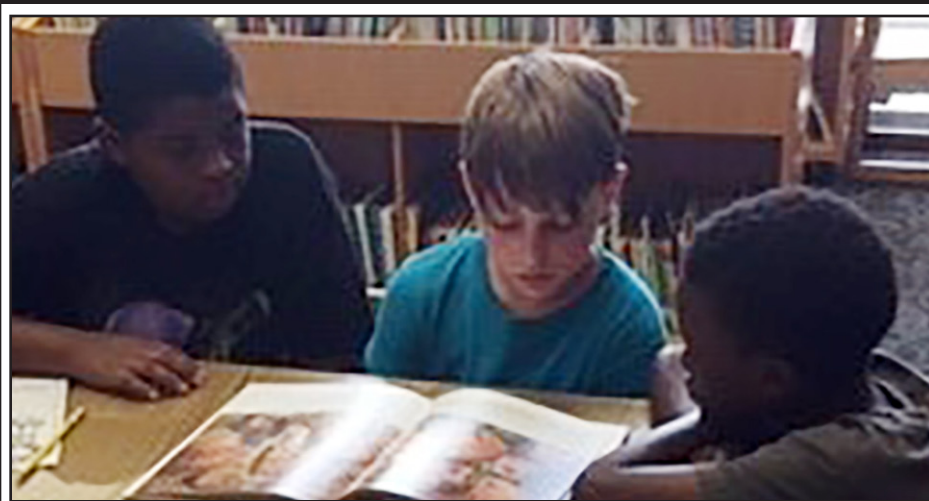
In library, fifth graders synergize as they work on story elements.