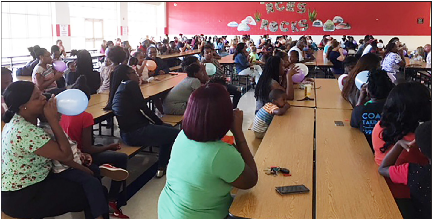
'Fall into Literacy Night' on September 26th started off with a Leader in Me parent presentation in the cafeteria. One of the goals of RCES this year is to teach parents the 7 Habits and ways that they can follow through at home with Leader in Me skills that their children are taught at school.