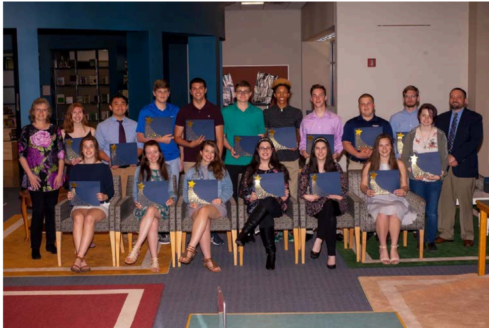
NMHS CMEA participants