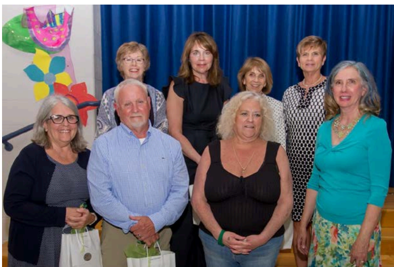
June retirees in attendance at the annual Reception.