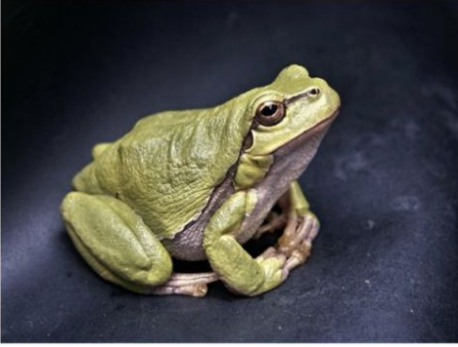
A green frog

Will see-through frogs clear the way for frog research?