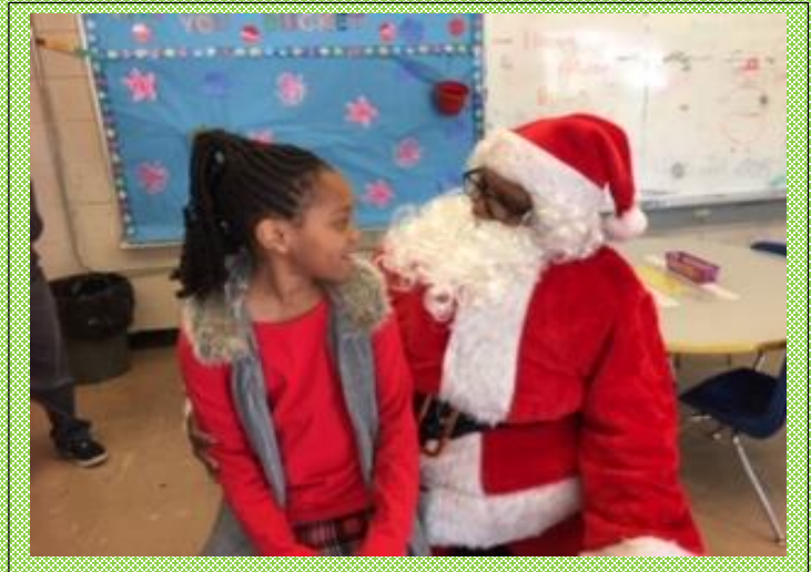
Celebrating the Season!