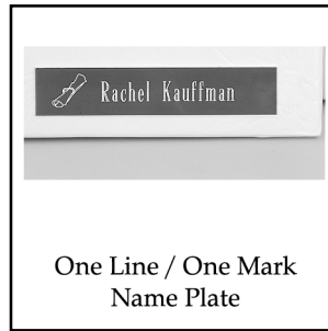
One Line / One Mark Name Plate