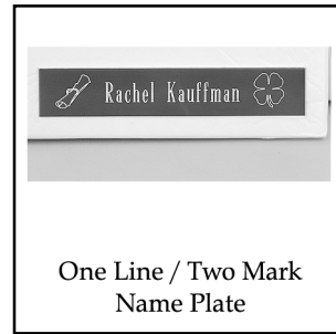
One Line / Two Mark Name Plate