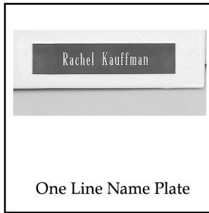
One Line Name Plate