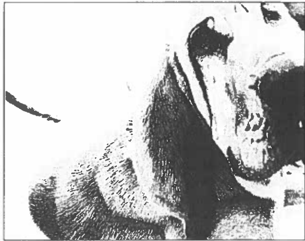
"Lazy Hound Dog"

Afterward, Low tried to feed the dog. He sought to win the animal's confidence, but the bloodhound was afraid of him. With bared teeth he crouched before Gordon's extended hand, and growled deep in his throat. He stood by the door, and whined. When Low crossed the cabin to open the door, the bloodhound sank on his haunches in the corner, ready to fight to the last gasp. When he found that the man did not attack him, he darted into the open, turned for one brief glance at the dark windows, and leaving behind him the silent cabin with its dead, swung into a long lope that carried him swiftly over the birch-clad 2 hill until he became a mere moving speck in the leafless forest. Thus the masterless dog passed into the wilderness.