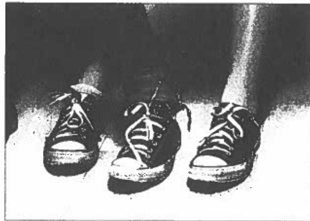
"Teenage Angst Has Paid Off Well"

They reported their observations in San Diego at the Society for Neuroscience meeting. (Neuroscience deals with the structure or function of the brain and other parts of the nervous system.)