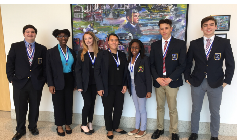
DECA Region Winners: