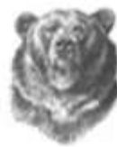
Houston County High