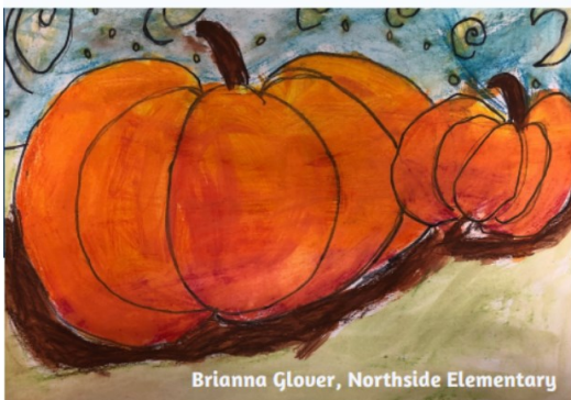
Brianna Glover, Northside Elementary