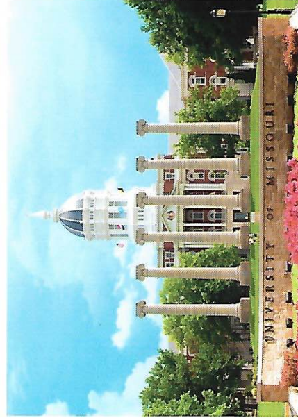
University of Missouri-Columbia

The Hagan Scholarship is a nationwide need-based merit scholarship designed to help high achieving students graduate college debt-free. Recipients must graduate from a public high school located in a county having fewer than 50,000 residents, or graduate from a remote rural school located in a county having more than 50,000 residents. ALL eligible schools are listed on the HSF website. The scholarship provides up to $48,000 over four years to attend college. Hagan Scholars from 43 states are currently enrolled at 358 colleges and universities. Five hundred more scholarships will be awarded in April 2021.