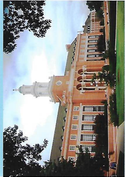
Oklahoma State University

About 40% of eligible applicants are awarded scholarships. The highest award percentage of any national scholarship.