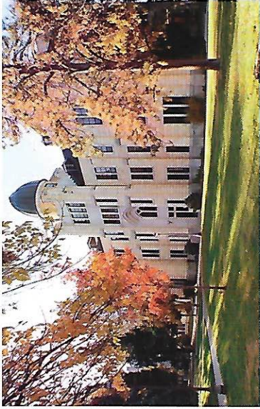
Fort Hays State University