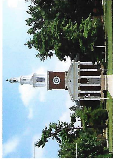
University of Kentucky