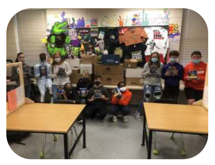
FCCLA members are pictured standing in front of boxes packed up and ready for Loaves & Fishes.