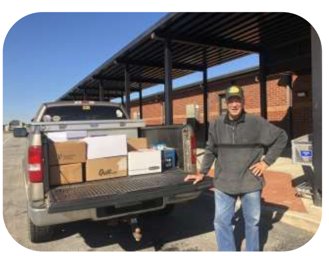
Pictured above is a volunteer from Loaves & Fishes picking up the boxes that helped local families over Thanksgiving.