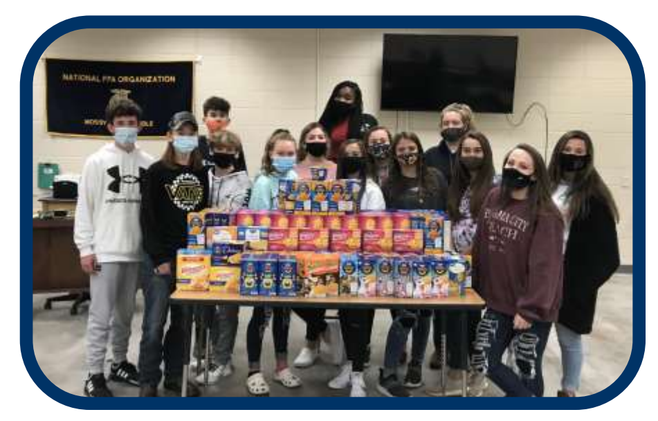
FFA members showcasing collected mac-n-cheese boxes.

Mossy Creek's FFA and FCCLA Chapters participated in a fun competition to see who could collect the most boxes of mac-n-cheese for a local food bank, Loaves & Fishes, located in Perry, Georgia. FFA and FCCLA members together collected over 700 boxes of mac-n-cheese within the two week time span given for the competition. All members of both organizations were excited with the amount of boxes collected. Knowing that these boxes of mac-n-cheese were going to help local families made it even more meaningful for the students. All members of both the FFA and FCCLA were very thankful they could give to others in this Thanksgiving