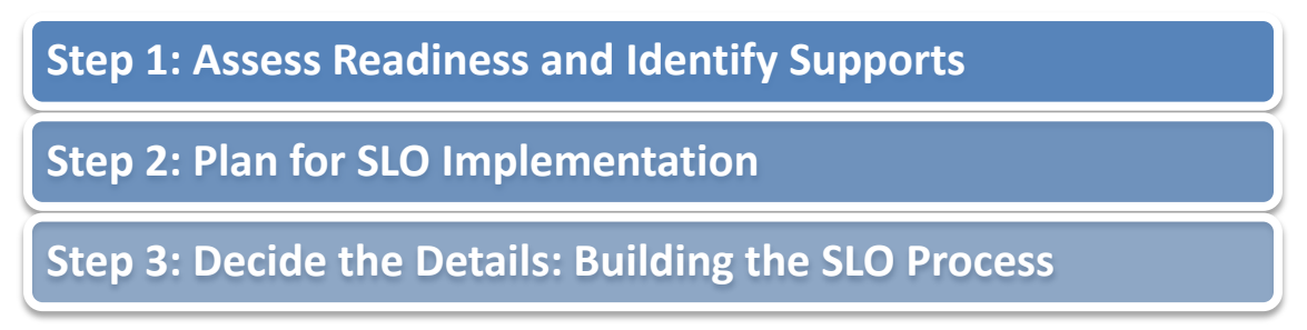
Figure 1. Overview of Steps for Developing an SLO Process

Implementing an SLO process across a school district requires careful planning and thoughtful execution by district staff. Joint committees play a critical role in ensuring that a rigorous SLO process is aligned with other district initiatives, is integrated into teachers' instructional practices, and lessens the paperwork and the time burden on teachers and evaluators as much as possible. This section provides a road map with step-by-step suggestions for Joint Committees to use when considering and planning for an SLO process. It begins with a high-level overview of the steps in developing an SLO process (Figure 1). Next, each step is discussed in more detail, including explanations, guiding questions, and links to resources to support Joint Committees as they work through each step.