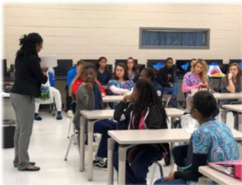
Life Link of Ga: Donate Life