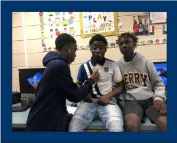
STEM is Fun and Engaging!