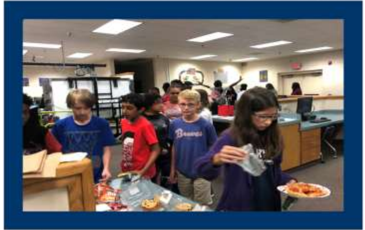
TSA students enjoy pizza and other snacks during the meetings.