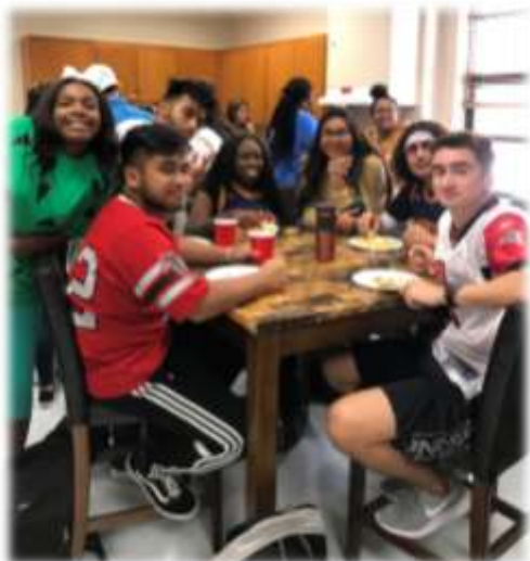
FCCLA members and their guest enjoying a Mexican Fiesta for Watch out Wednesday.