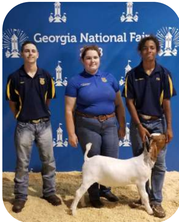
Goat Team at the Georgia National Fair