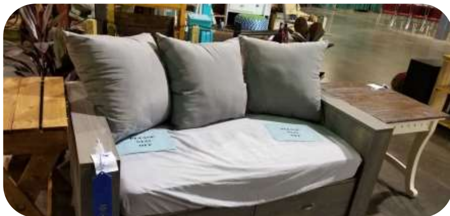
Winning sofa at the Georgia National Fair