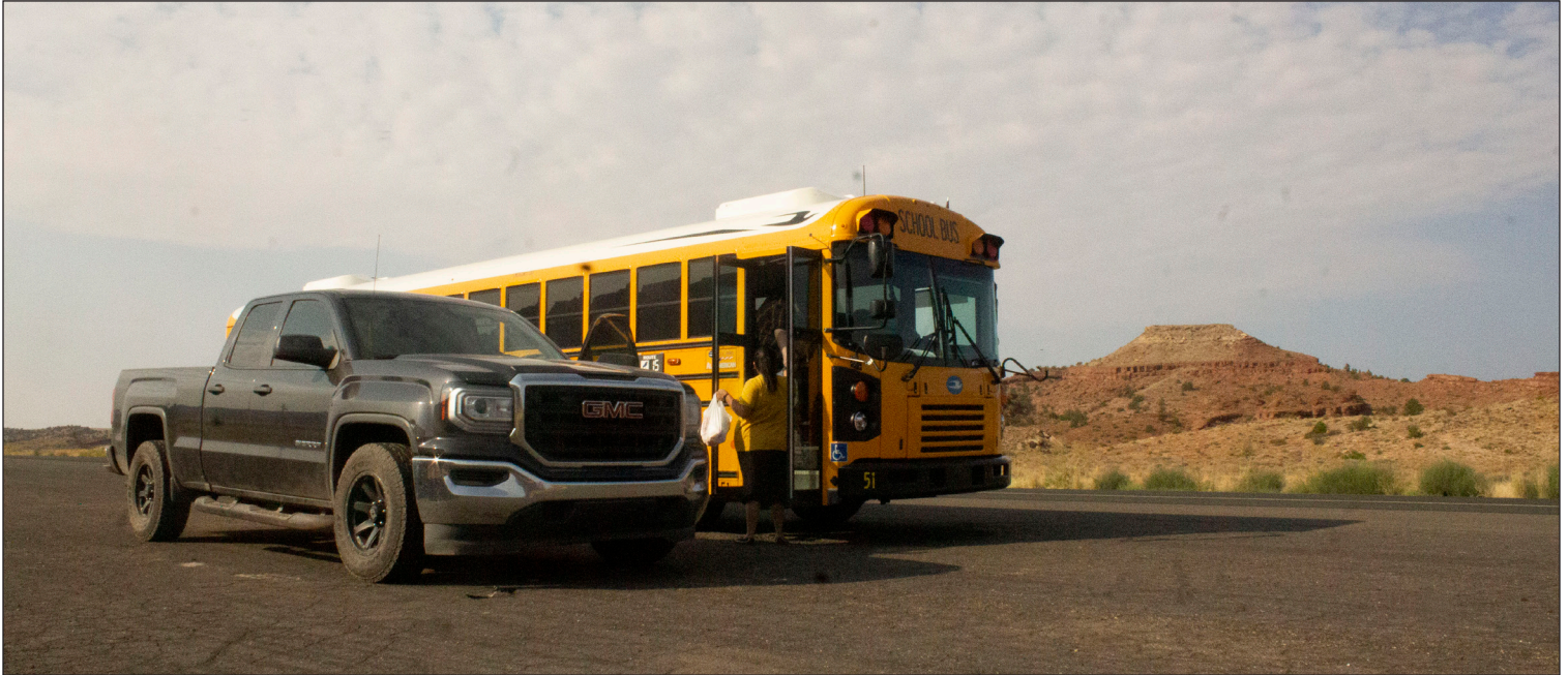
PUSD's Nutrition Services delivers meals to a Bittersprings family .