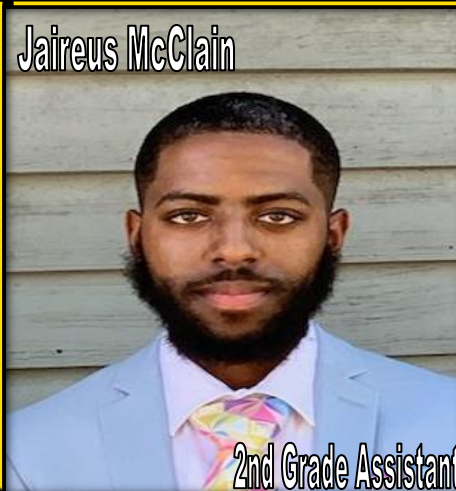
2nd Grade Assistant