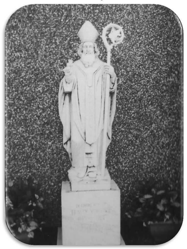
Celebration of the Holy Sacrifice of the Mass