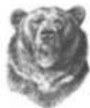
Houston County High