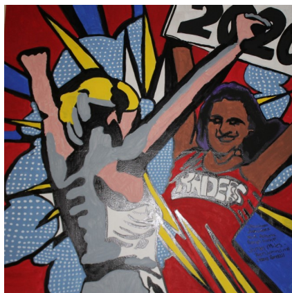
Class of 2020