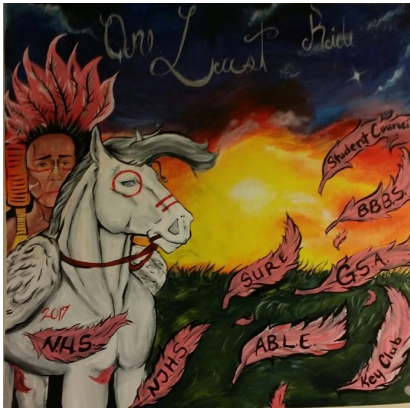
Class of 2017