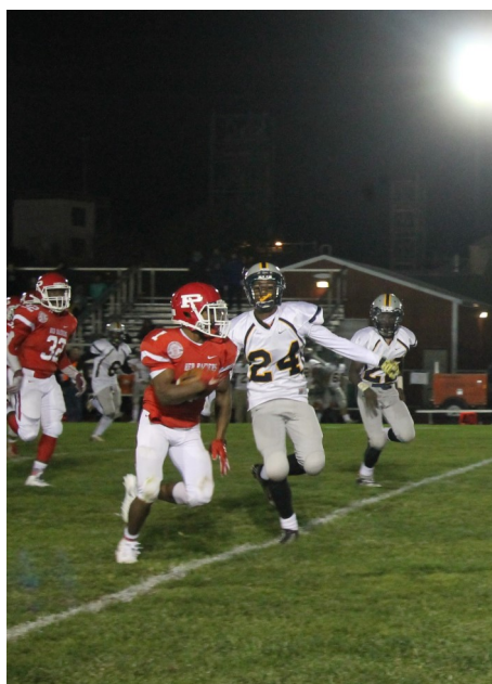
PHS Varsity Football Team

ers will see if they can keep it going when they play Pennsville Eagles in the semi-finals of the playoffs. This team beat the Red Raiders last year 27-13 in the semi-final, hopefully this year it changes and the Red Raiders can make it to the championship game against Salem or Woodbury.