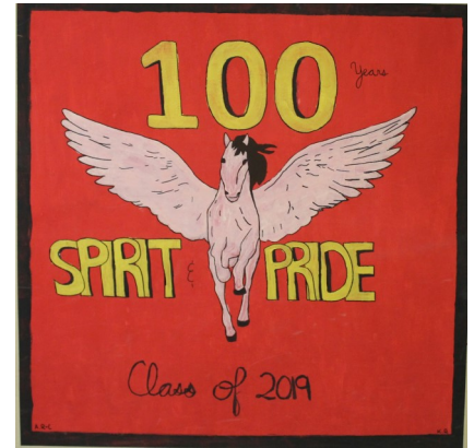
Class of 2019