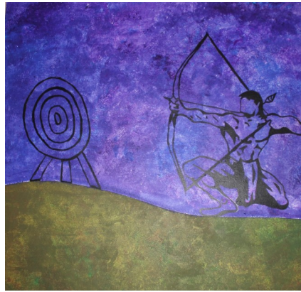
Class of 2018