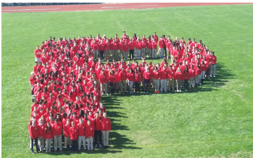
Students of PHS/ PMS