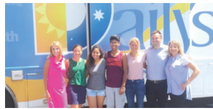
The Shircliff Society of young professionals touring our school while the St. Vincent's mobile unit was on campus providing healthcare and immunizations to the families and children we serve.