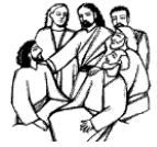
Calling the Twelve to him, he sent them out two by two. Mark 6:7 (NIV)

These were his instructions: "Take nothing for the journey except a staff—no bread, no bag, no money in your belts. Mark 6:8 (NIV)