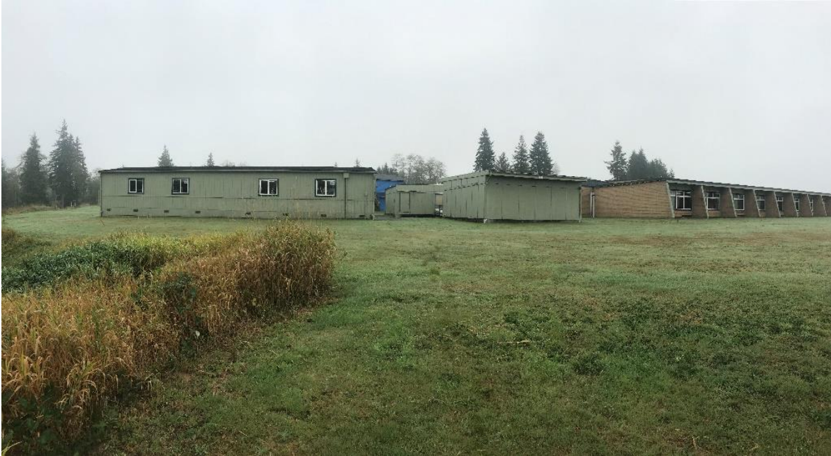
The current Knappa Middle School Facility