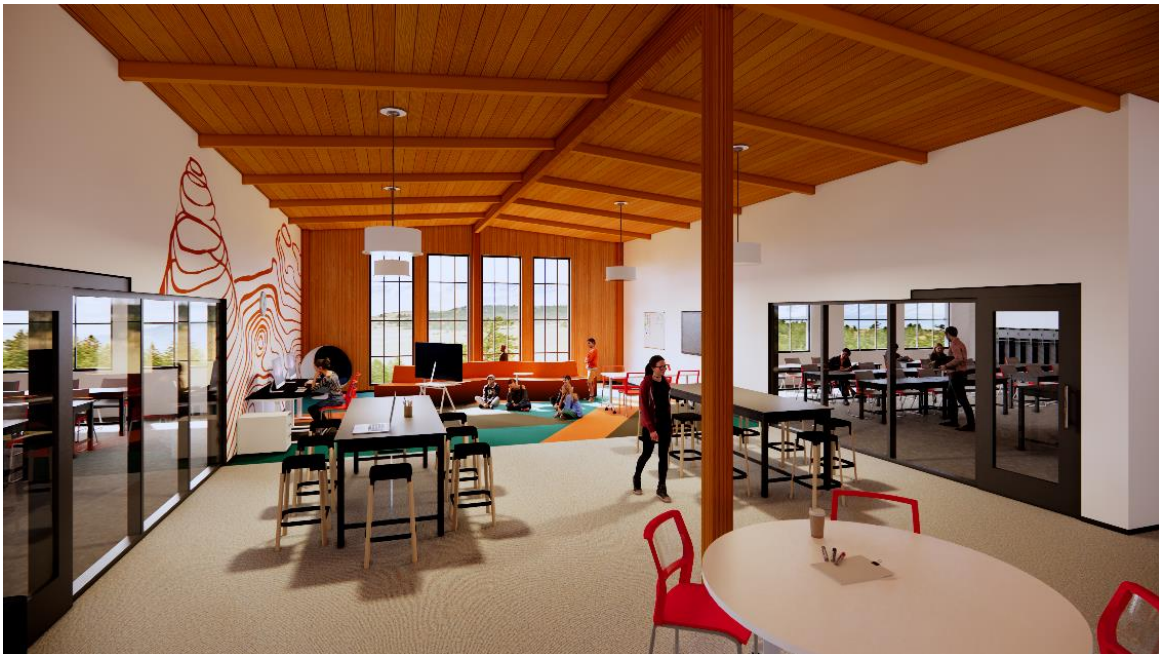
A rendering of the new middle school learning hub adjacent to the new science lab and one of the classrooms.

On May 17, 2021, the Knappa School Board authorized a Resolution for a November 2, 2021 Bond Measure. The proposed bond will address critical maintenance issues, improve safety, and update middle school classrooms.