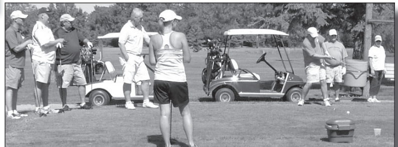
155 golfers, 38 teams participated in the 7th annual golf scramble on July 29 during the Marshall County Fair. The weather was wonderful again this year!