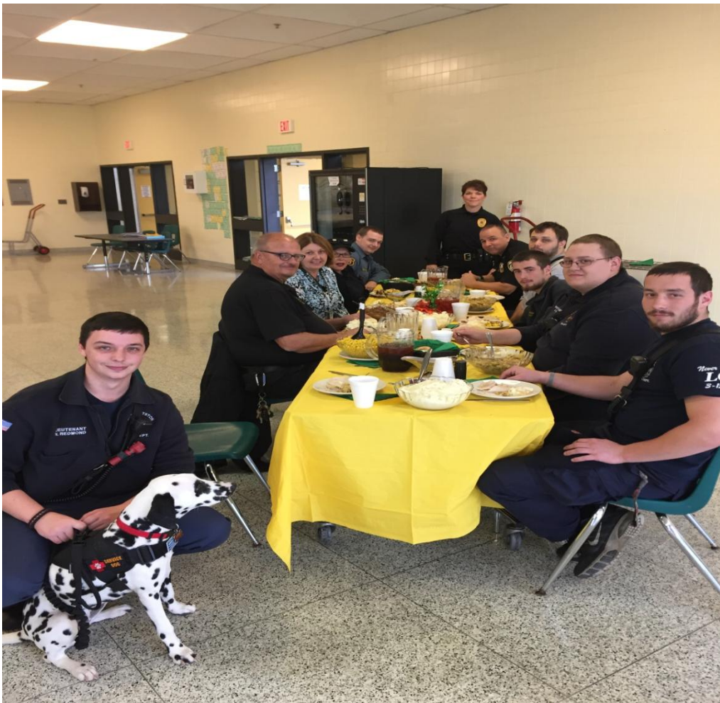
Exeter, PA. December 12, 2017