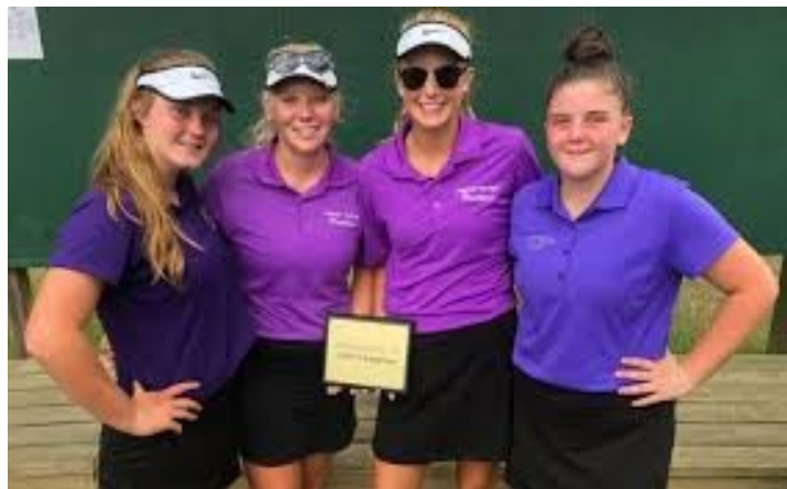
As a team, Dawson Springs finished the All-A State Tournament in 10th place with a score of 456.

Dawson Springs Girls' Golf team claimed the All-A regional title Saturday, Aug. 22, at the Hopkinsville Country Club.