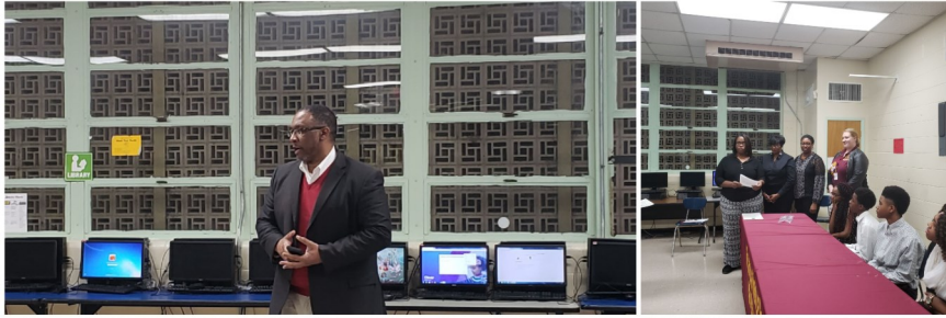
Beta Club Inductee Ceremony.