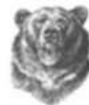
Houston County High